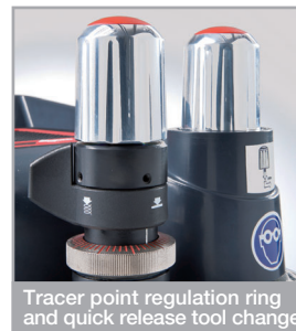
Tracer point regulation ring and quick release tool change

Matrix Pro is provided with a quick release tool change system to facilitate the machine set-up. Cutters and tracer points can be easily identified thanks to the coloured plastic collars, red and black respectively, with the name of the tool engraved on. This patented solution is a Silca exclusive and helps