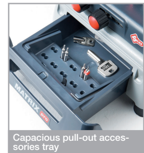
Capacious pull-out accessories tray